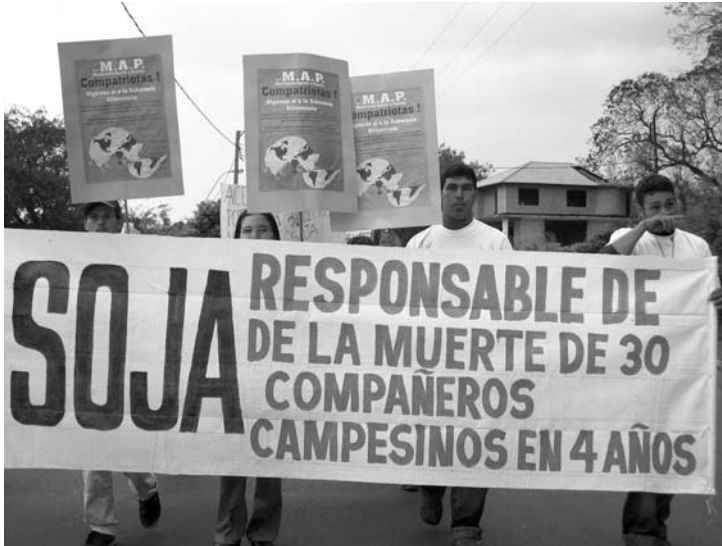
Protest against RTRS conference in Paraguay. August 2006