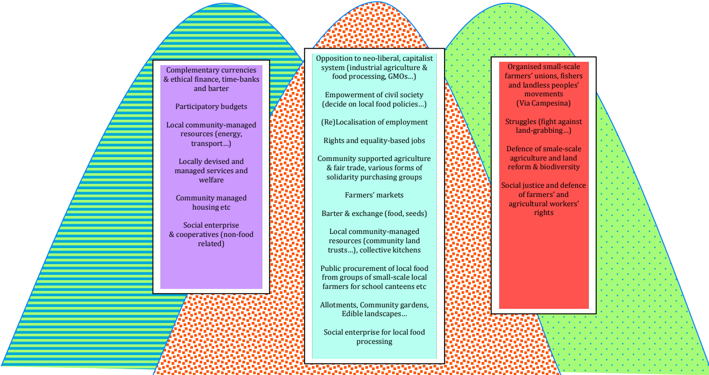
Judith Hitchman, 2012

The above diagram is from a background paper written by the author in 2012 to support the FAO Consultations with civil society in Baku, Azerbaijan, in 2012. The full document can be found as an attachment at the address below. xvi