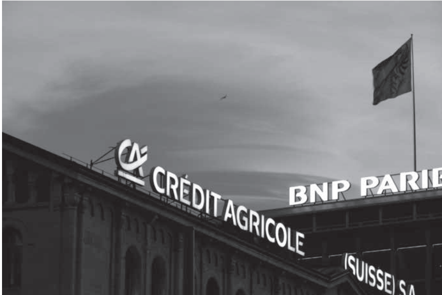
NADINE / CC BY-NC-ND 2.0