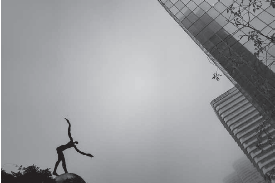
SCALVENZI BENJAMINE CC BY 2.0

Creating the Centre is a collective decision and should be built “from below”, from the communities and movements involved the campaign. They need to orchestrate alternatives and actions against the overall system of impunity that allows transnational corporations to get away with so much. An internal consultation process is currently underway in order to lay the foundations for such a space. Its objectives include awareness-raising, providing support for social, political and legal processes, creating tools for training and support, systemising research and documenting cases, and teaming up with organisations that are already documenting cases.